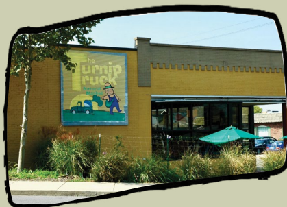
The original location in 5 Points in East Nashville.

Founded in 2001, the original Turnip Truck Natural Market opened as a local neighborhood store built for the community—offering real food, transparent sourcing, and a welcoming place to shop. This first location set the foundation for everything to come.